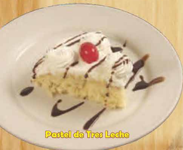
Pastel de Tres Leche

Pastel de Tres Leche - 4.99 Flan - 3.99 Churros Mexicanos - 4.99