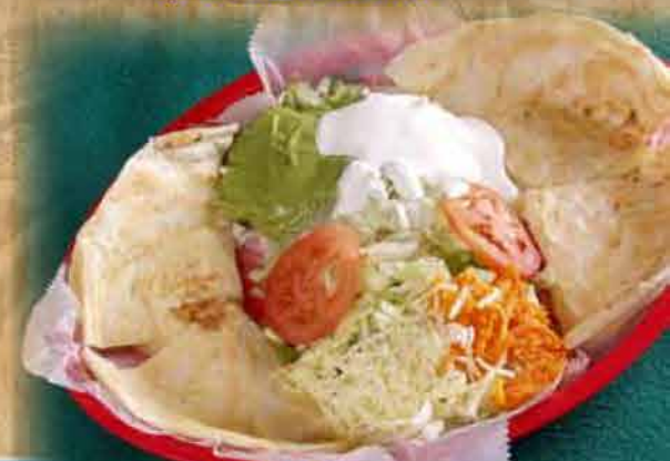
Pollo y Queso