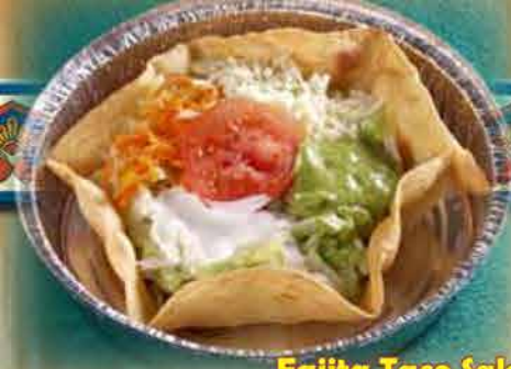
Fajita Taco Salad